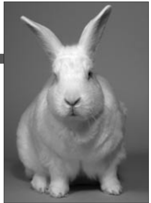
Miss July, the model for the Rabbit Advocate Easter ad, is a very photogenic girl.