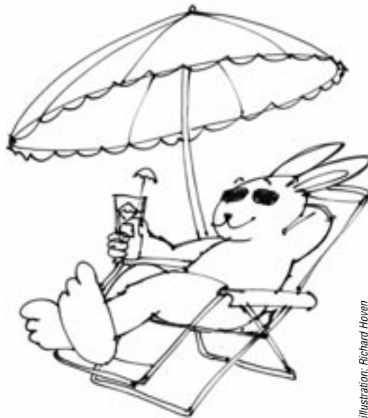
Illustration: Richard Hoyer

Fill an empty milk or juice container with water and freeze it. Your rabbit will cuddle up to it when he needs to cool down.