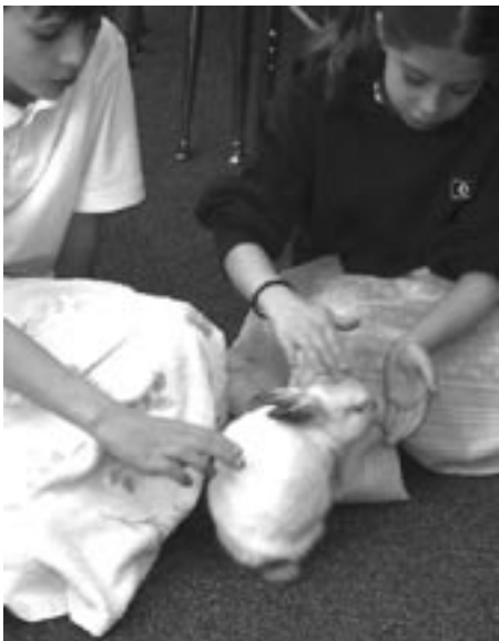
Cloud with Oregon Episcopal School students who have learned that a real rabbit is a ten year commitment.