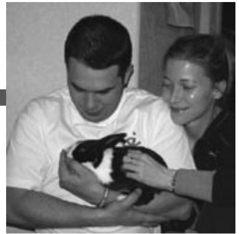
Harmony and Rex were the first to adopt a needy bunny from the Best Friends Reno rescue ranch.

house on the property to meet the Best Friends employees and ask where to start. They were feeling just as overwhelmed as we were. To give you an idea, it takes three to four solid hours just to feed and water these rabbits, if you work as fast as you can. Rabbits were being shuttled to local vets for spay/neuter appointments, several a day, which by Rabbit Advocate standards is fantastic, but when you are looking at such massive numbers, it feels like grains of sand on the beach. As we were feeding the rabbits, we noticed every cage with girls in it had multiple litters, new ones every day. With about half of the rabbits being unspayed girls, that's a lot of pregnant bunnies. Part way through the first day, we discovered boys mixed into the girls' cages, so we decided that we should recheck the sexing. Easier said than done! These are not tame rabbits, for the most part, they are feral and terri-